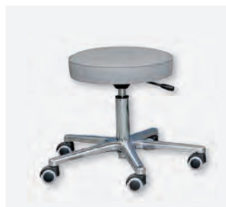
1 DH-2000 (soft double castors)

The swivel stools belong to the indispensable equipment in every medical practice or facility. To ensure users and patients enjoy a comfortable sitting position, these swivel stools can be continuously adjusted in height (by foot or hand release).