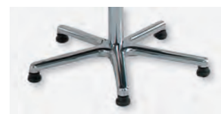
5 Base with gliders