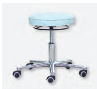
2 DH-2000/RA (soft double castors)