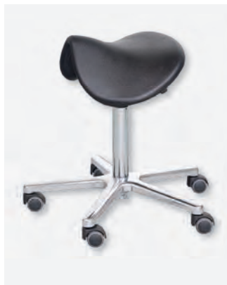
1 SH-2000/LG (soft double castors)

The square examination stools are an alternative to the various stools and chairs described previously. They are available in a lacquered or chrome-plated frame finish.