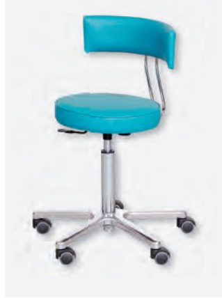
2 DS-2000/RLLG (soft double castors)